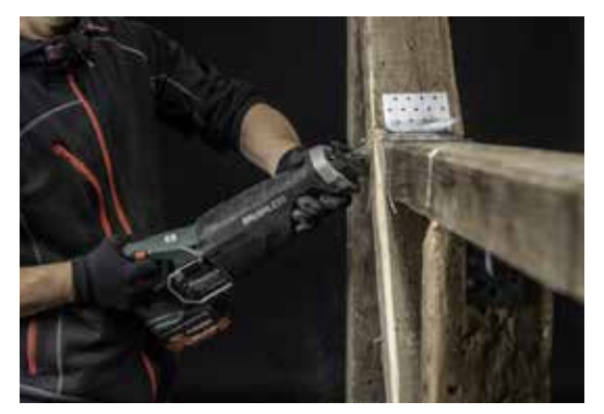
From wood to metal: The most powerful cordless sabre saw SSEP 18 LTX BL MVT from Metabo also saws mixed materials with efficiency and is therefore ideal even for demanding demolition work.

The selectable pendulum stroke of the new Metabo 18 Volt cordless sabre saw SSEP 18 LTX BL MVT ensures a particularly fast sawing progress even for very demanding applications.