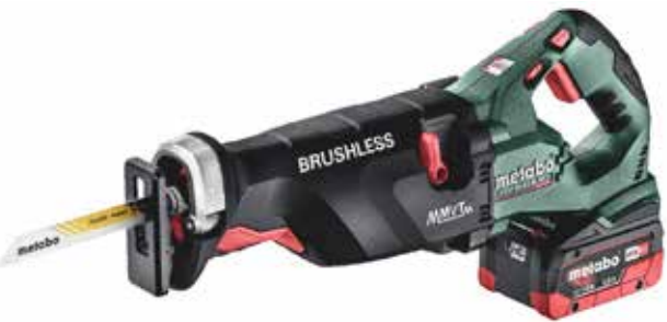
The new 18 Volt cordless sabre saw SSEP 18 LTX BL MVT from Metabo is extremely powerful and the fastest on the market. This makes it the ideal tool for very demanding applications.

The new cordless sabre saw also scores in terms of speed between the cuts: Users can change the saw blade my means of a lever on the housing. The lever can be operated conveniently in any position and even with gloves. The depth guide can also be adjusted without tools so that the saw blade can be optimally used. The speed selection ensures the best possible sawing performance in any material. "Furthermore, we have optimised the handle of our new sabre saw and positioned at an angle. Like this the machine always fits well in the hand in different working positions", explains Knauß. A robust aluminium housing protects the saw even in rough surroundings. The saw can be easily suspended from the integrated scaffolding hook and easily stowed away during work breaks.