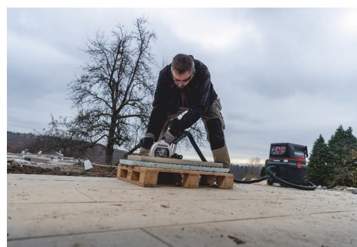
For different applications and customer requirements there are also the matching accessories for the angle grinders.

The cordless angle grinders also impress with optimal handling and ergonomics: With the Metabo M-quick function, discs can be changed quickly and without any tools. Thanks to the rotating battery pack base, users enjoy maximum flexibility. In narrow or difficult positions the battery pack base can be rotated into the right position.