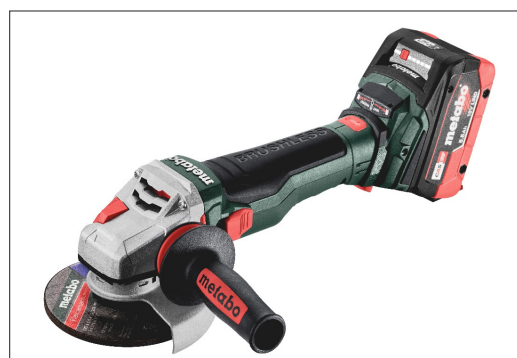
The angle grinders of the new 1,500 Watt class, such as the WB 18 LTX BL 15-125 Quick, are the most compact and powerful 18 Volt cordless angle grinders in the world.