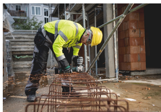
The new 700 Watt class angle grinders are ideal for all types of cutting applications, from tiles to reinforced steel. This is of particular interest to construction workers.