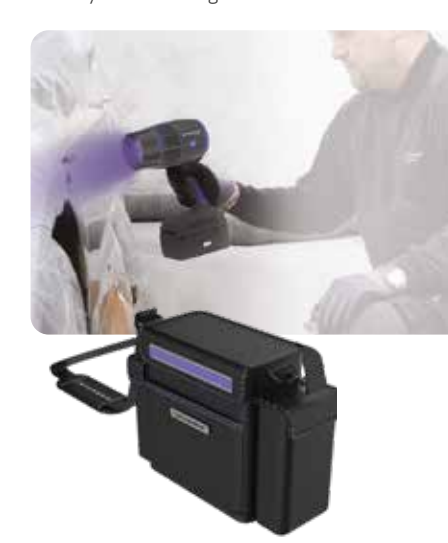
Supplied with display for battery life and curing time

Delivered in a practical nylon bag including exchangeable SPS battery, SPS charger and UV protective glasses.